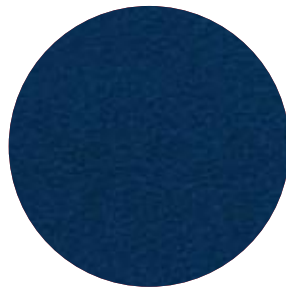
Rich Navy Blue